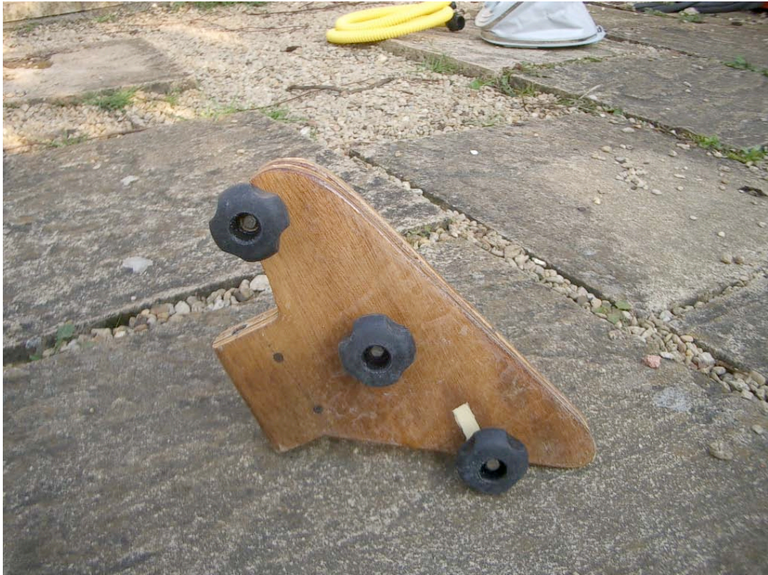
stern transom fitting : the three bolts go through holes in a the hypalon flap, that is designed for the Gumotex rudder. The Gumotex model would be too weak for sailing