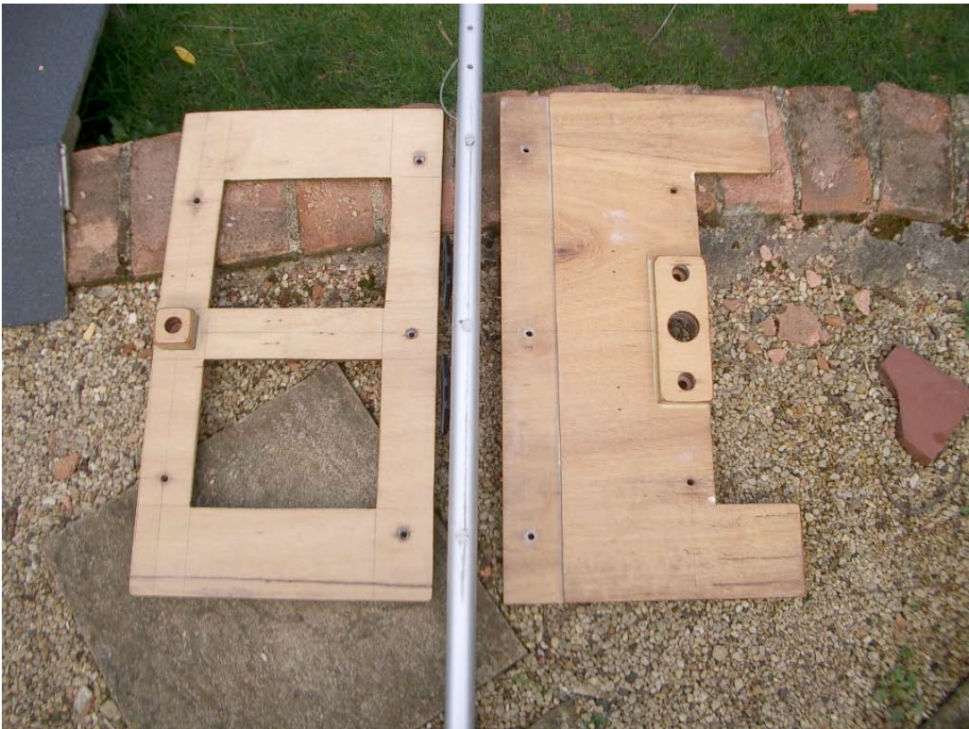
Two sections of top plate of rig support system, to be bolted together with the outrigger thwart. There are two sections to ease packing for airline transport