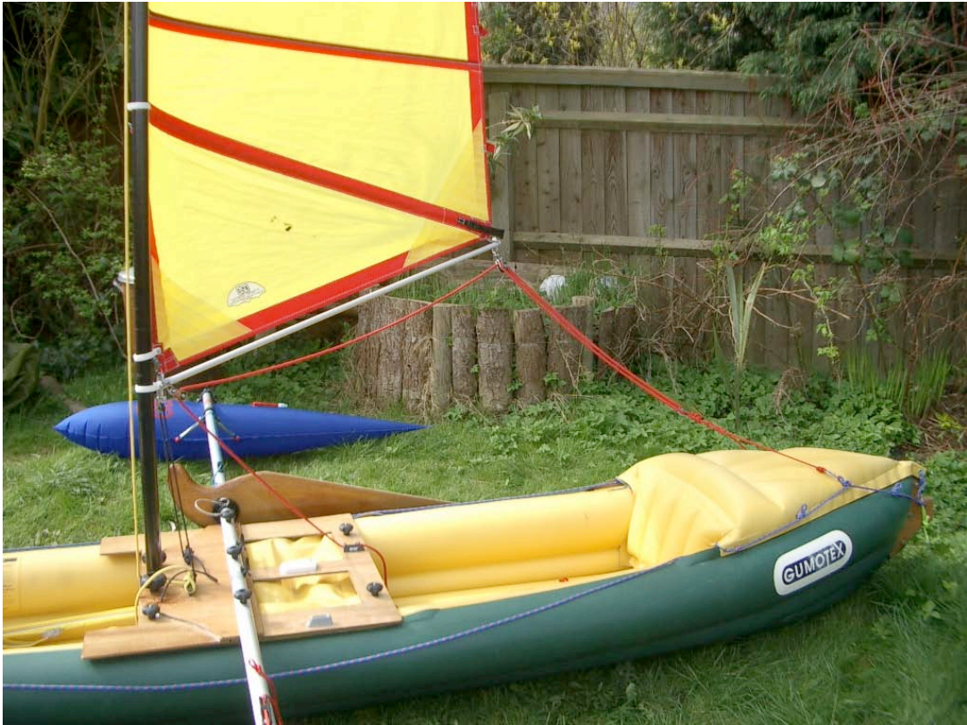
carbon fibre mast, sail and outriggers installed