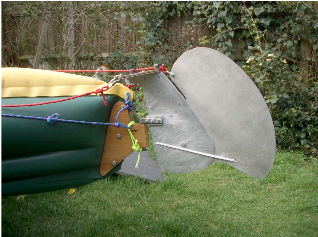
Rudder in up position for beaching