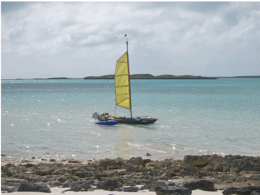
At anchor in the mysterious shallow waters of the Bahamas