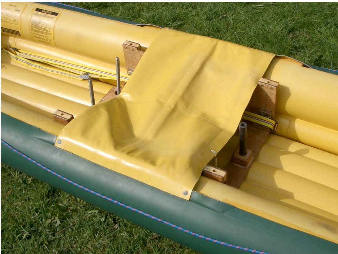
bottom section of rig support system strapped into boat using existing tie down points that are originally intended to support gumotex paddling foot supports