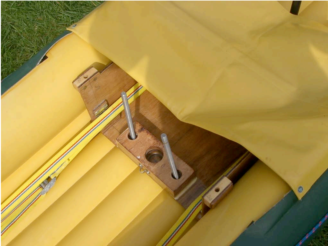
mast foot in situ