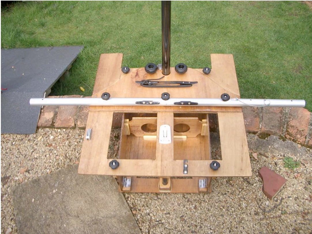
mast support system fully assembled (top view)