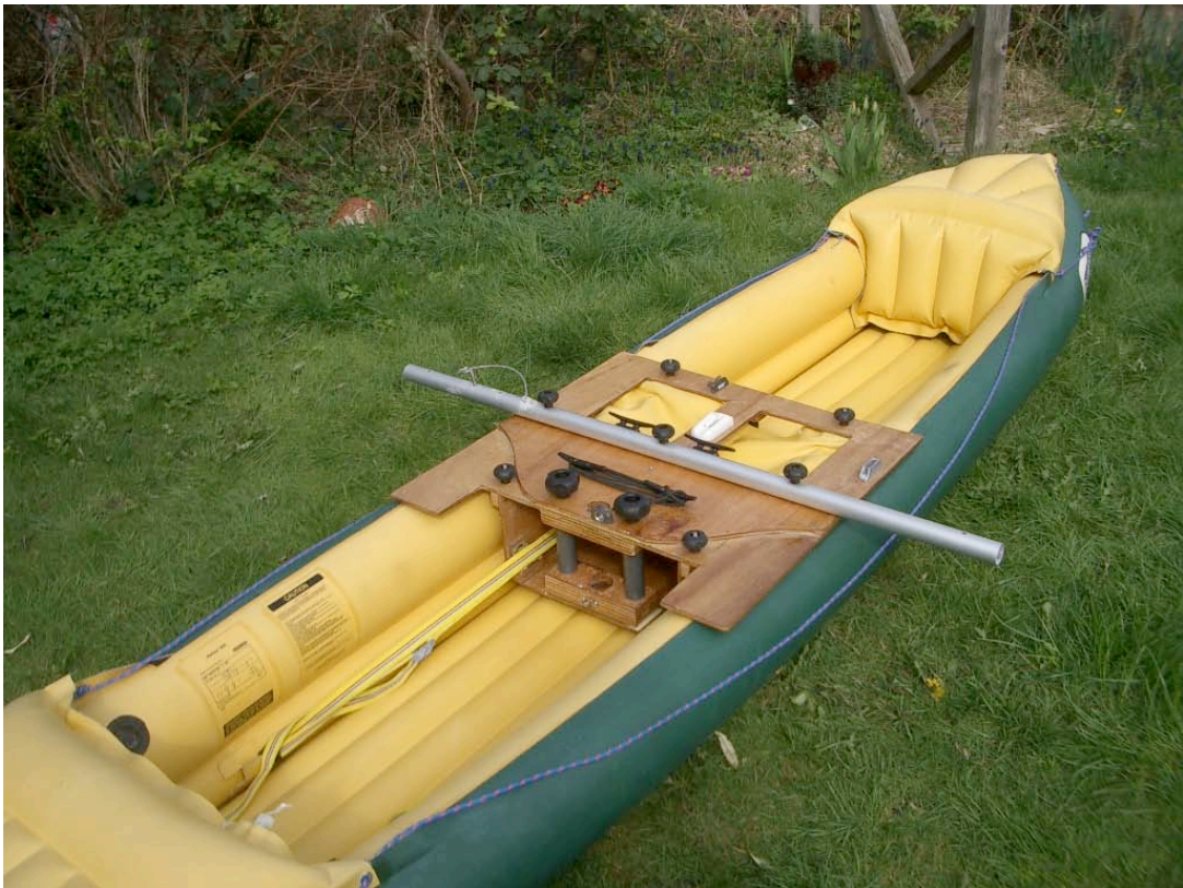
mast support system installed in boat