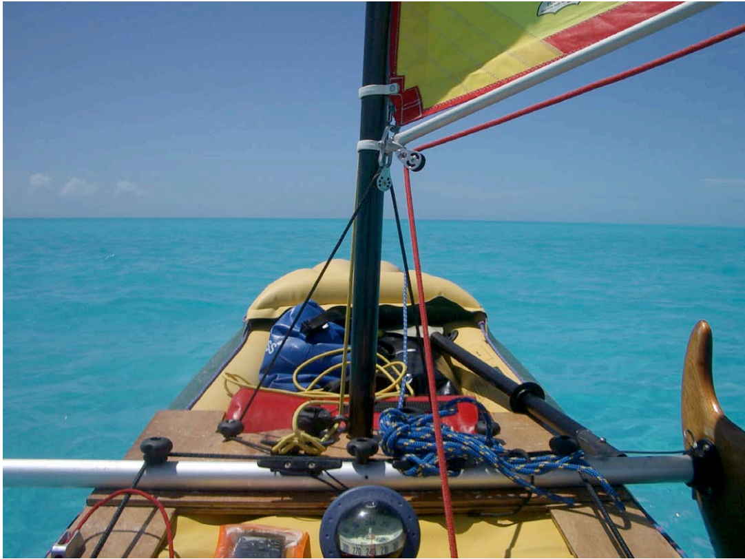
view from the cockpit