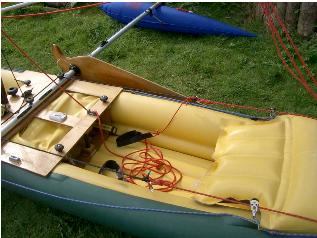
cockpit, showing steering lines, red ropes kept in tension by black bungee cord and controlled by black foot stirrups