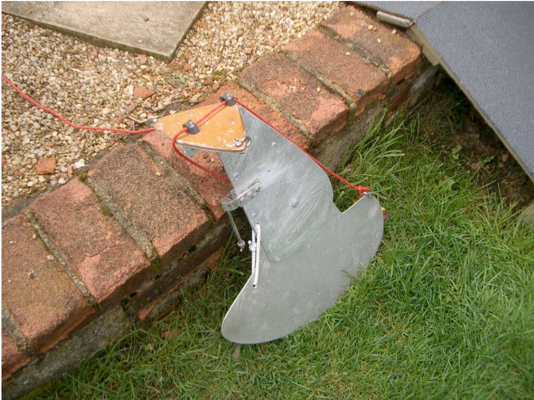
rudder showing yoke