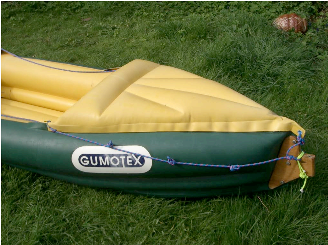
transom attached to stern of boat