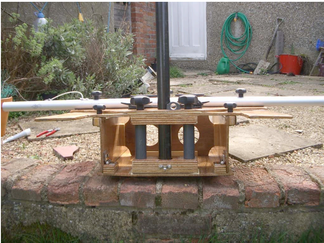
mast support system fully assembled (front view)