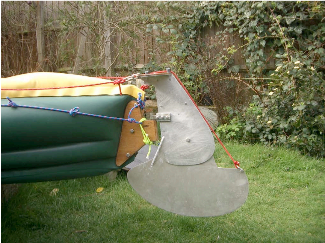
Rudder attached and in down position held by elastic cord. The previous pintle was damaged by rot and the existing one came from a "Sunfish" and bodged together