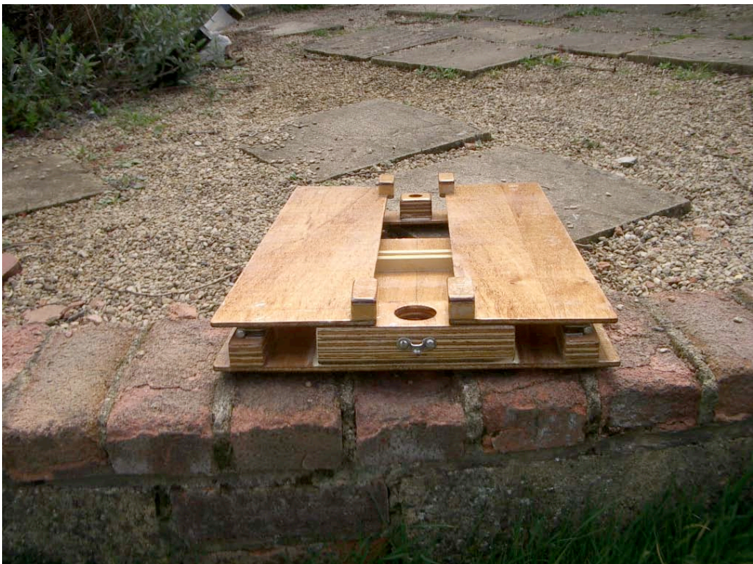
bottom section of rig support system (folded for transport)